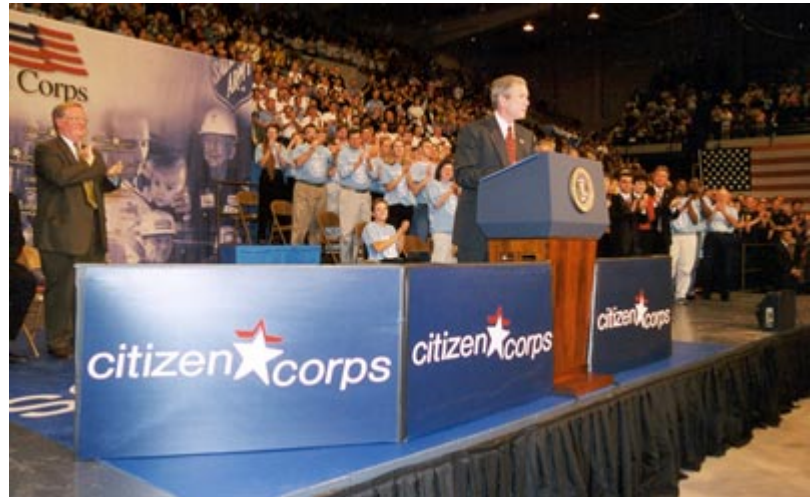
Knoxville provided an enthusiastic audience for President George W. Bush's April 8 Address at the Civic Coliseum.