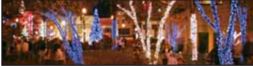
Dazzling lights in Krutch Park start Nov. 25

Christmas in the tiny town of Tinsel, Texas, with a parade of eccentric guests at Snowflake Inn. Price Thurs. & Sun. $10 and Fri. & Sat. $15. www.theatreknoxville.com (865) 544-1999