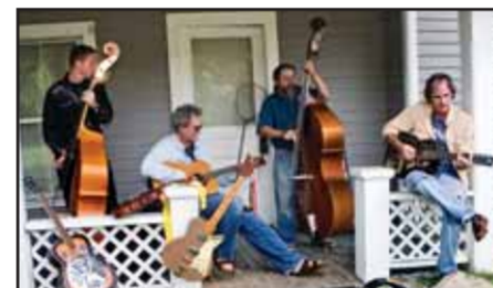
Pistol Creek Catch of the Day